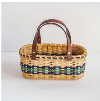
SU446 Sunday 8 am-12 Noon Lita's Tote Marilyn Parr

4 Hours W 5&6" L 10&12" H 4" All Levels $55