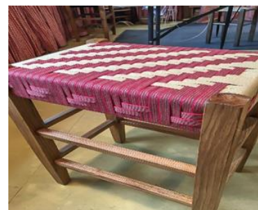
SU449 Sunday 8 am – 12 Noon Shaker Tape Bar Stool Jean Reed

4 Hours W 6" L 9 1/2" H 5" Intermediate $45