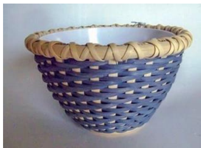
SU442 Sunday 8 am-12 Noon Snack Bowl Elaine La Porte

4 Hours W 2 1/2" L 2 1/2" H 2 1/2" All Levels $45