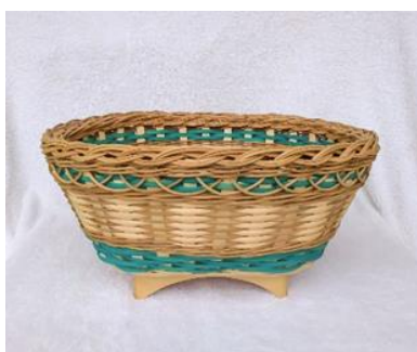
FR814 Friday 8 am -5 pm

8 Hours W 9" L 13" H 9 1/2" Intermediate $99