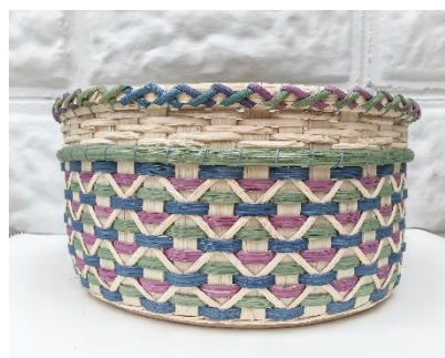
FR823 Friday 8 am-5 pm