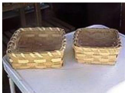
SU445 Sunday 8 am – 12 Noon Small and Large Nesting Napkin Set Billy Owens

2 for the price of 1: The small and large napkin baskets are made of hand split white oak trees. Woven on a mold, this basket has a woven "Herringbone" bottom and will be an added attraction to any table on any occasion. I will share all things concerning the Ozark method of basketry. Everyone should finish in class.