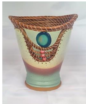
FR819 Friday 8 am-5 pm

8 Hours W 8" L 12" H 6" 12" w/ Intermediate Handle $89