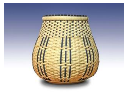
FR825 Friday 8 am-5 pm