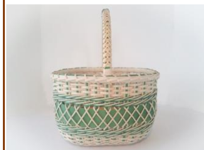
FR817 Friday 8 am-5 pm