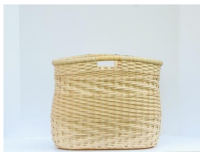
FR812 Friday 8 am-5 pm