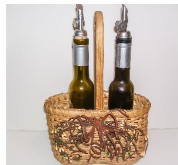
SU444 Sunday 8 am – 12 Noon Oil and Vinegar Becki Newsome

Basket is woven on a wooden base with an attached handle in the center. This is a continuous twill weave. Emphasis will be stressed on the shaping of the basket. A rusty bow with choice of colored pips will be used for the embellishment. This is a fun, relaxing weave that everyone will enjoy (Bottles are not included).