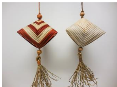
SU437 Sunday 8 am – 12 Noon Hexahedron Karen Kotecki

A hexahedron is a 3-dimensional figure with 6 equal sides. You will also construct your own mold that will be covered and captured in the basket. You'll be weaving a continuously-woven double-wall basket. Weave a first hex in natural to learn the techniques. Followed by the second in color in a pattern you design.